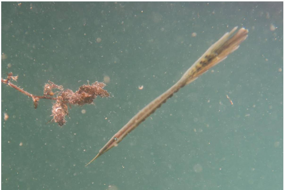
Fig. 2. The same fish further down the water column with head directing downwards.