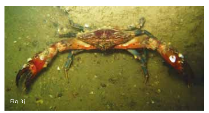
Fig. 3. Animals caught in traps and released after being photographed: eel-tail catfish (a), thunder crab (b), copper-banded butterflyfish and leatherjackets (c), blue-spotted stingrays (d); and encountered while diving in Raffles Marina: jellyfish (e), sea snake (f), flatworm (g), schooling fish (h), sea cucumber (i), red swimming crab (j).