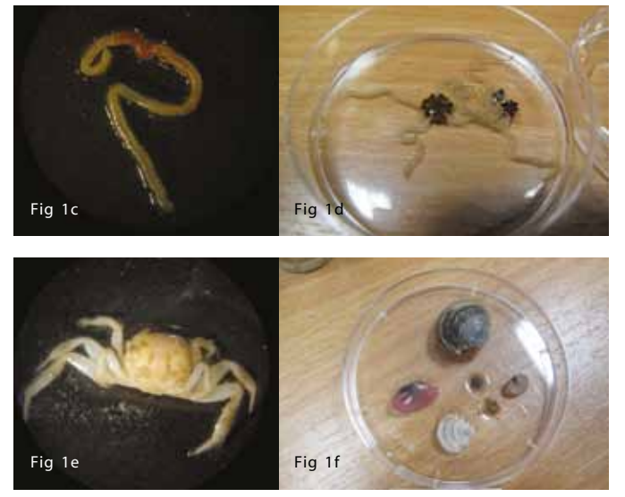
Fig. 1. The Ekman grab (a) and sieving station (b) are used to survey the soft bottom sediment. Animals that live in the soft bottom sediment of Raffles Marina include segmented worms (c), brittle stars (d), crabs (e), and bivalves (f).

This was evident when a team of marine biologists from the Reef Ecology Laboratory of the National University