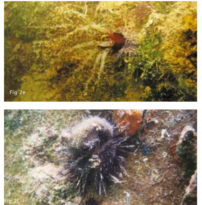
Fig. 2. Flora and fauna on the sides of pontoons at Raffles Marina: branching soft corals (a), sponges (b), sea squirts (c), juvenile fish among green bubble algae (d), filter-feeding sea cucumber (e), and sea urchin (f).

The pontoons are encrusted with an assortment of marine life. Surveys involve snorkelling beside the pontoons and taking photographs to quantify the biodiversity growing on them. Ninety species of flora and fauna have been identified. Thirty-five percent of the pontoons are covered by algae, followed by sponges (13.5%), bivalves (7.8%) and soft corals (7.5%) (Fig. 2). However, suspended sedimentation levels within the marina are moderately high, resulting in some sessile organisms and pontoon surfaces being smothered.