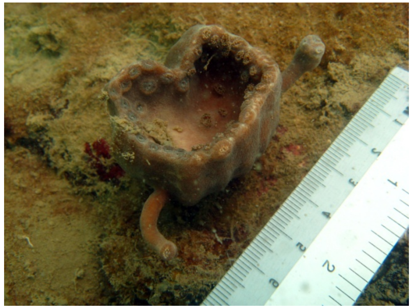
Fig. 2. Juvenile Turbinaria peltata with atypical extensions from the sides of the colony.

The area was a sandy shore prior to reclamation and seawall construction. No coral reefs were known to exist along that stretch of the shore in the past. The seawall apparently provided a suitable hard substrate for the settlement of coral larvae transported by sea currents. Based on a survey conducted in Feb.2010, the marina's inner seawall was colonised by more than 50 species of scleractinians. Among them, a juvenile Turbinaria peltata colony (~ 4 cm wide) found at a depth of 4 m below mean sea level exhibited an unusual morphology (Fig. 2).