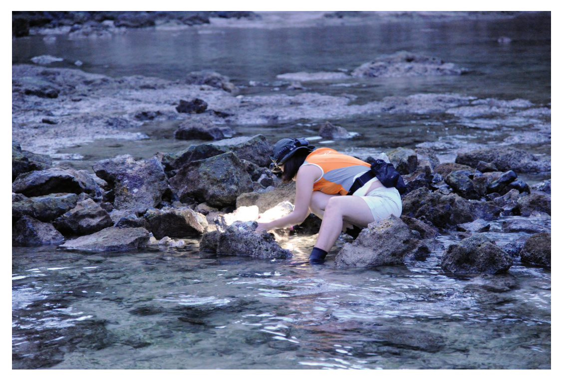
Fig. 2. Low tide at Waterfall Bay, Christmas Island, Australia.

Fig. 1. Known collection localities of Pontomyia natans in the Indo-Pacific. Star symbols represent sites prior to this study (filled star indicates type locality at Apia, Upolu Island, Samoa). Filled pentagon denotes Christmas Island, Australia.