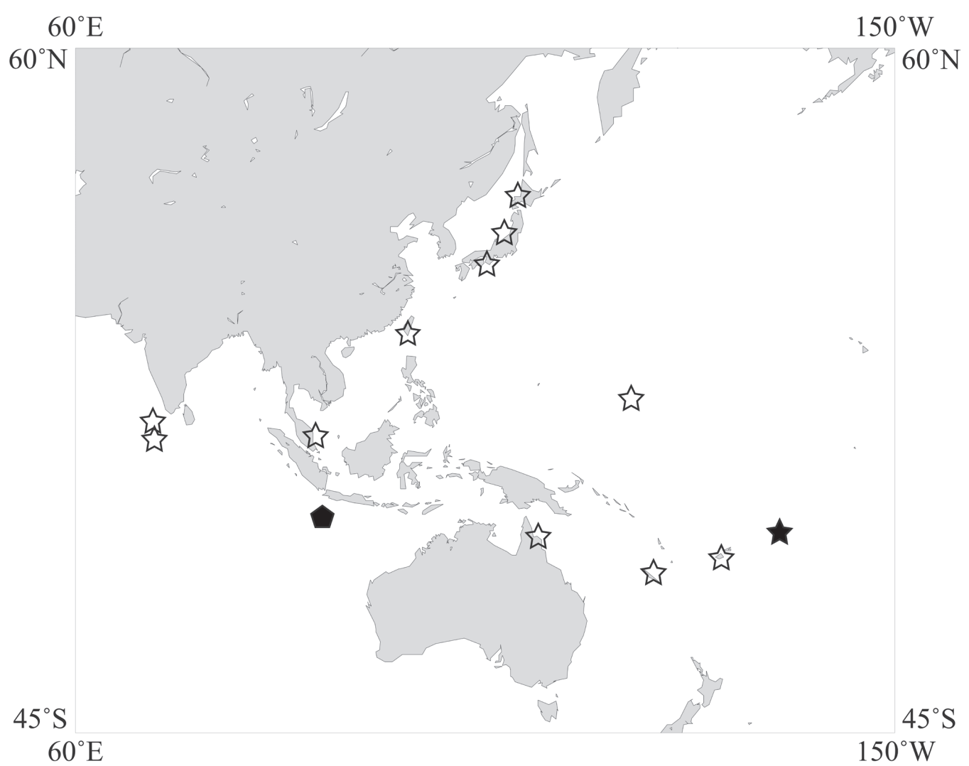
Fig. 1. Known collection localities of Pontomyia natans in the Indo-Pacific. Star symbols represent sites prior to this study (filled star indicates type locality at Apia, Upolu Island, Samoa). Filled pentagon denotes Christmas Island, Australia.